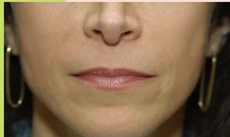
1 Year, still 50% better than the Before